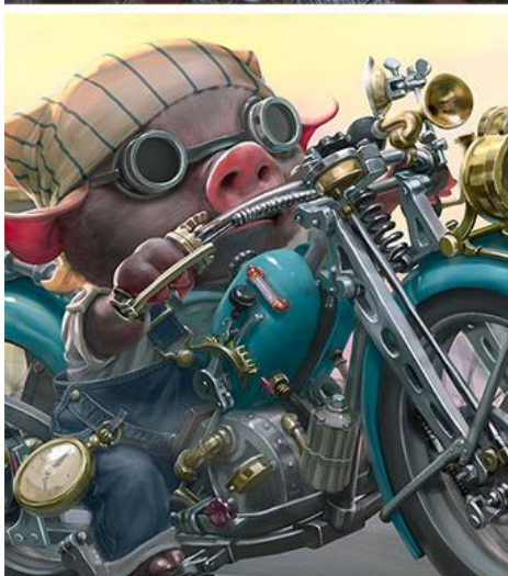
ILLUSTRATION AWARDS AND EXHIBITIONS